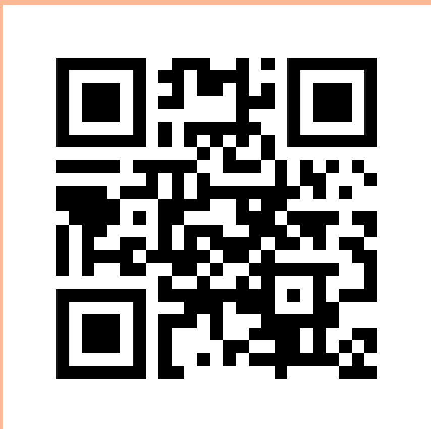
Visit our Website

Proceeds from this event will support scholarships for Sevier County students taking dual enrollment classes at WSCC, as well as junior and senior students at ETSU Sevierville working toward their 4-year degree.